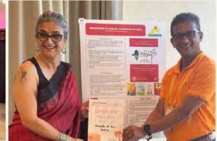
FOM's poster on MPN FAQ booklets winning 3rd prize at the MPN HZ Conference, held in Netanya, Israel, in November 2022