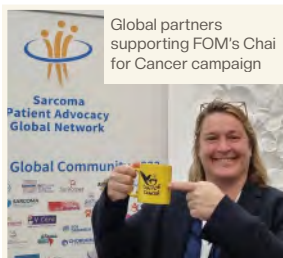
Global partners supporting FOM's Chair for Cancer campaign