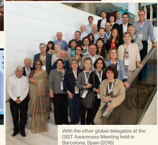
With the other global delegates at the GIST Awareness Meeting held in Barcelona, Spain (2016)