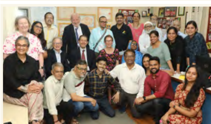
iCMLf Global team members with FOM Trustees, Mumbai City Chapter Leaders, and The Max Foundation India team at the Max Center during their 2023 visit to Mumbai.