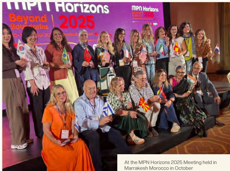
At the MPN Horizons 2025 Meeting held in Marrakesh Morocco in October