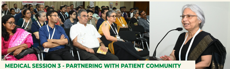
MEDICAL SESSION 3 - PARTNERING WITH PATIENT COMMUNITY