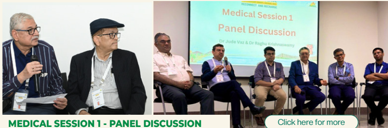
MEDICAL SESSION 1 - PANEL DISCUSSION