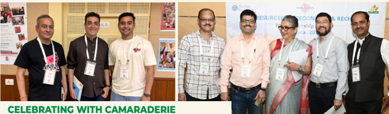
CELEBRATING WITH CAMARADERIE