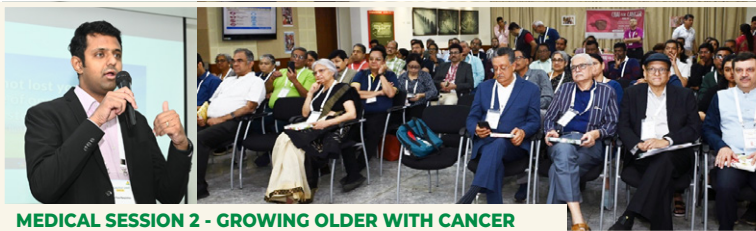
MEDICAL SESSION 2 - GROWING OLDER WITH CANCER