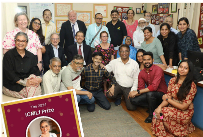
iCMLf team visit to The Max Foundation, Mumbai office in November 2023. Seen here with some FOM City Chapter Leaders.

Project Shiksha , (supporting schooling for pediatric patients) wins the Runner Up Prize at the CML Horizons conference in Berlin.